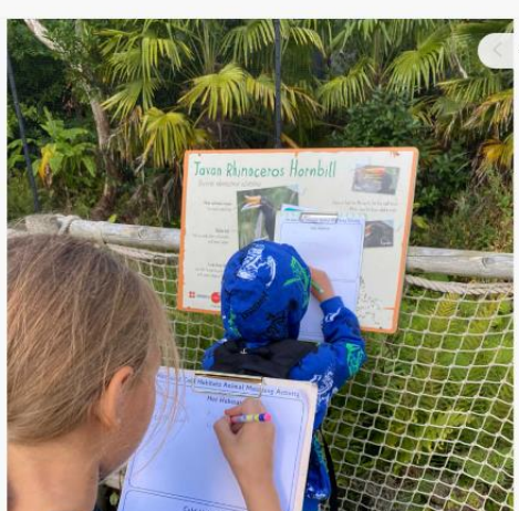
Cata (Year 5 flexi) has been using her science skills of classifying animals on her trip to the zoo

CG We went to the zoo to classify animals from hot and cold habitats. Using a map we looked where the country was in relation the equator. We found lots of animals from hot and warm habitats but non from cold so we went to the library to research! We decided that next time it would be good to add another category for warm habitats. Cata also made a giraffe headband 🦒